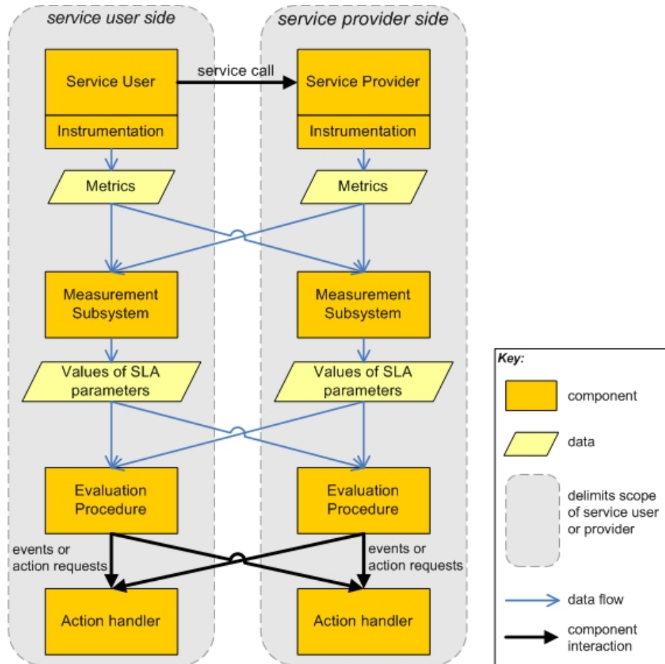
Figure 1: Conceptual Architecture for SLA Monitoring and Management (adapted from the work of Ludwig and colleagues [Ludwig 2003])

The evaluation procedure checks the values against the guaranteed conditions (i.e., the service level objectives) of the SLA. If any value violates a condition in the SLA, predefined actions are invoked. Action-handler components are responsible for processing each action request. While the functionality they execute will vary, it will likely include some form of violation notification or recording. Action handlers may exist on the service user machine, service provider machine, and/or third-party machines.